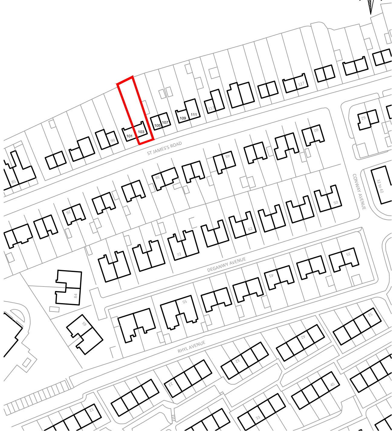
EXISTING SITE LOCATION PLAN. SCALE 1:1250